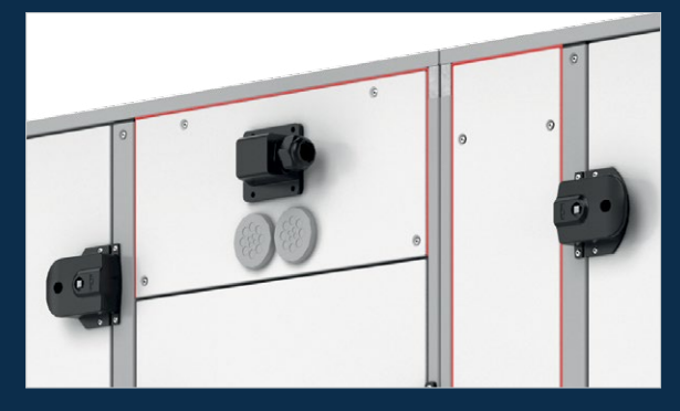
Connection panel makes it easy to connect up power and data cables. Extra space for on-site cable trunking next to the panel.