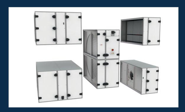
Easy to bring into any building – unit can be split into 3 or 5 sections.