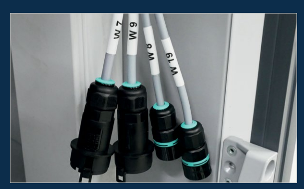
Prepared and encoded connectors for easy cabling.