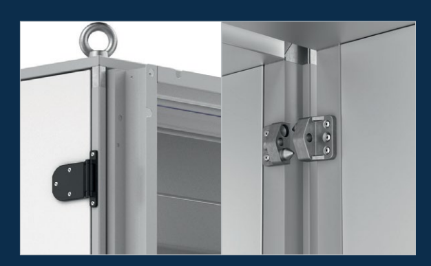
Unit connectors and lifting eyes from our Easy Lifting system make installation as easy as possible.