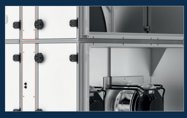
No need to drill holes during installation: Test ports for evaluating the system installed as standard.